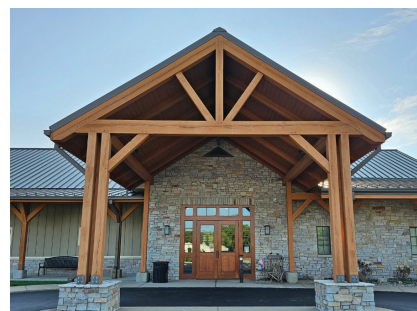
Trimble County Public Library

We are pleased to share this Chapter's success in supporting the Trimble County Public Library, an essential hub for literacy, programming and community services.