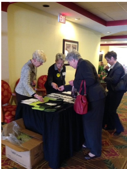
Annual Meeting Registration