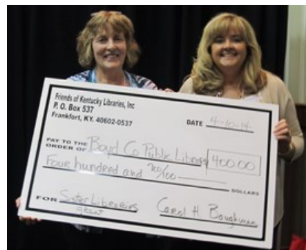
In 2014 Sister Library Grant was awarded to the Boyd County - Elliott County Partnership.

The deadline for receipt of grant applications is February 24.