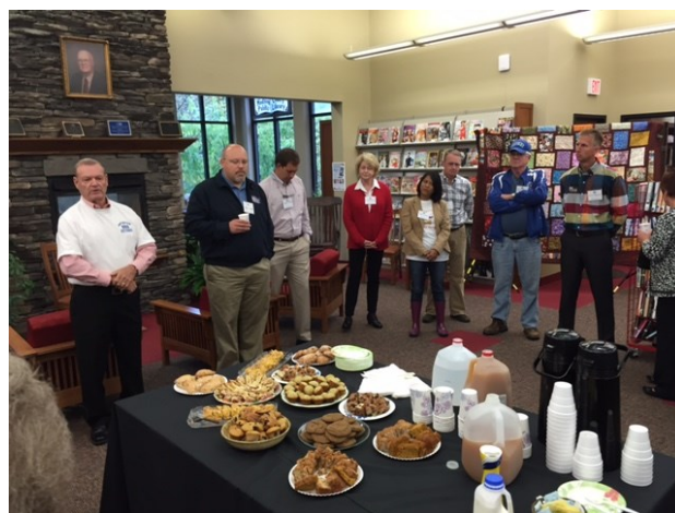
Madison County Meet & Greet, Oct. 11, 2014

FKL appreciates the hard work and creativity of library staff and friends and encourages more and more libraries to consider hosting Meet and Greets in 2015. It’s never too early to start planning!