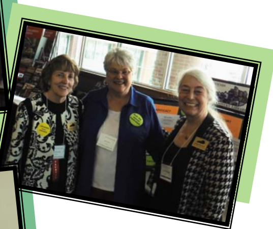
Friends Board members working the advocacy and membership table at the Kentucky Public Library Association Conference held in Bowling Green.