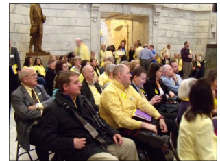
Library supporters gather in the Rotunda

Friends came from far and wide—from Pikeville to Paducah; from Covington to Franklin—they convened at the state capitol wearing yellow and asking legislators to support certain proposed legislation and defeat other bills or amendments.